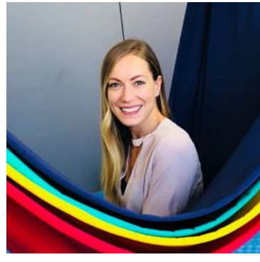
Lots of other kids to play with